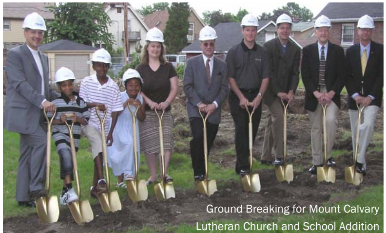
Ground Breaking for Mount Calvary Lutheran Church and School Addition

Our finish carpentry work has established a reputation with national contractors, millwork fabricators, and construction managers. We are honored to be requested for the Cheesecake Factory Restaurant millwork in Peabody, Massachusetts and Long Island, New York.